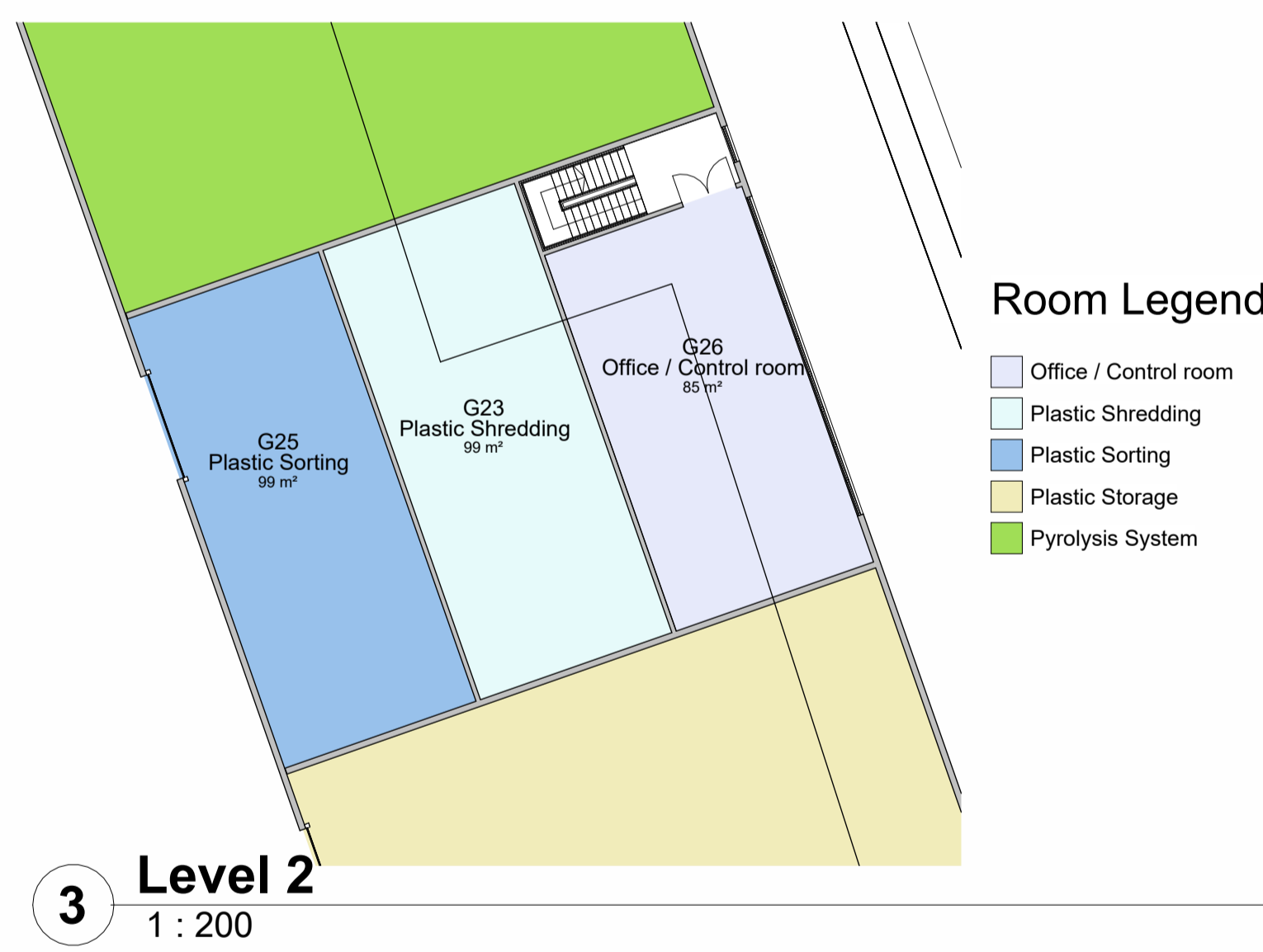
3 Level 2 1 : 200